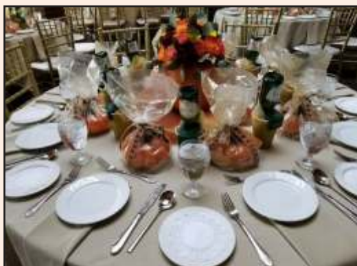
Beautiful Table Settings Greeted the Ladies