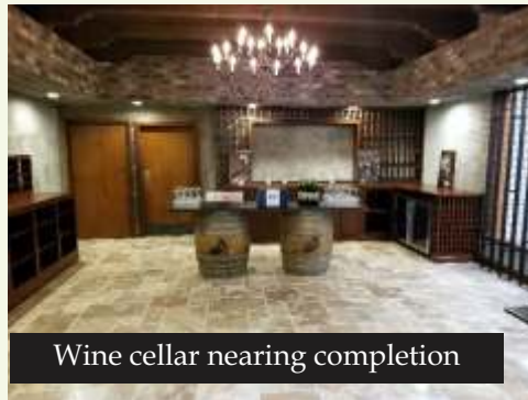
Wine cellar nearing completion

We take every member and community concerns very seriously. With that in mind, we have prepared a new process for any request of outside services, HOA related issues or any other concerns. The form is called a resolution form. Any member or community member that needs to make a request to the Club should fill out this form and email it to customercare@dovecanyongc.com . You can pick up a copy of this form from our front desk, or visit our website www.dovecanyongc.com and download the document from our homepage.