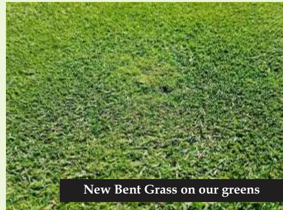
New Bent Grass on our greens

As mentioned in our previous communication, we are continuing to audit and improve the operation of our near 2000 sprinkler head inventory on the course and at the clubhouse. It's a long process that includes reprogramming our central computer, mainline pressure optimization, and visually inspecting each sprinkler run. We're starting to make headway as you see less wet and dry areas on the course, particularly near the green complexes.