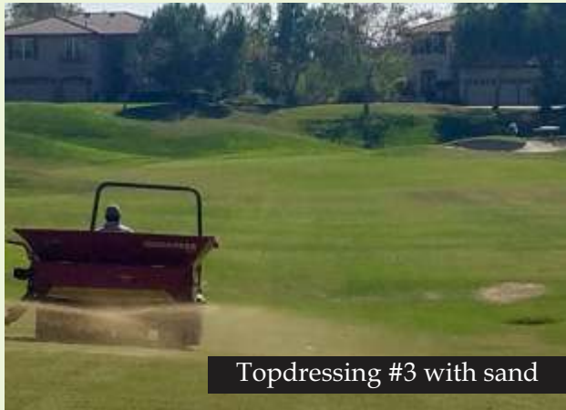
Topdressing #3 with sand

As we head into the middle of fall, we are continuing our process to improve the playing conditions of our course. During our recent aeration, we bombarded the weak spots in our greens with bentgrass seed in order to take advantage of its ability to deal with salts and drier soils. You'll no doubt notice the bentgrass begin to pronounce itself as we continue to tailor our fertilizer program to its benefit. The goal is to slowly increase the percentage of bentgrass to help us through the long summers.